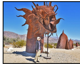
Metal sculptures are scattered across the Borrego desert.

Beautiful spots we have loved so much we have returned to multiple times include the State Park in the small town of Borrego Springs in southern California. We've returned to the perfect wintering hole climate, art shows, farmers markets, scenic desert surrounded by mountains, metal sculptures scattered around the desert, seasonal wild flowers, wild Borrego sheep, palm tree oasis, and Mexican influenced menus in the many local restaurants.