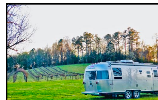
Peaceful night in a Mississippi winery thanks to Harvest Hosts.

In parallel with great food, we have put a few wine growing destinations in our trips specifically Paso Robles in California and the Kelowna Valley in British Columbia. There is a fine balance choosing down to earth wine destinations with ease of access and availability of campgrounds