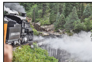
Durango and Silverton Railway lets off steam.