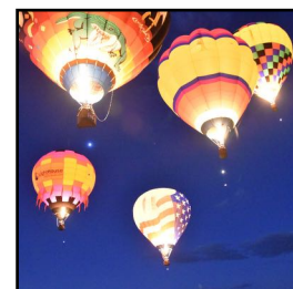
Albuquerque pre-dawn ascension of the first flight of balloons.

Among our spectacular activities, the Albuquerque Balloon Festival must rank near the top of life's rich experiences. The South West Caravan had arranged for the first two rows of Airstreams offering coveted center location, and it is truly without doubt spectacular. The joy of getting up before 5 am to witness the first group of balloons lifting off to