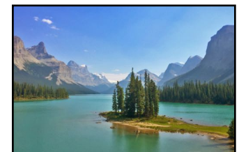
Spirit Island on Lake Maligne near Jasper - a classic iconic photo location.

Prince Edward Island, Canada, in the St Lawrence estuary is another of our favorite destinations with at least