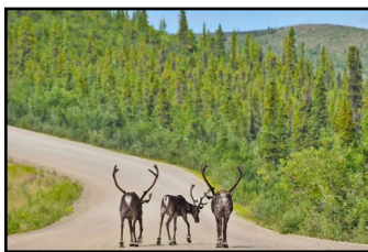
Top of the World Highway in Yukon with a herd of caribou.

Some destinations fall into the category of Edmund Hillary's famous quote "Because it's there!". Alaska is certainly as far as our wheels will take us and what a magnificent journey up the Alcan Highway, then up the Top of the World Highway through Yukon to the US border near Chicken Alaska. That's as far off the beaten path as you will get! On a side trip to Eagle, we discovered that the route north comes to a complete end - beyond that is only the Arctic tundra and wilderness! Memorable destinations along the Alaskan highways that we loved include Homer and Seldovia on the Kenai Peninsula, Valdez and the Columbia glacier on Prince William Sound.