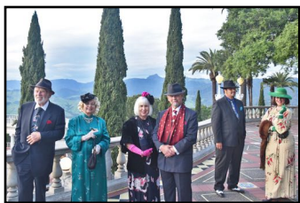
Reenactors at Hearst Castle made each stop a pageant of past grandiose life.

Our travels along the Californian Pacific coast included two heritage destinations - the Paul Getty villa at the Pacific Palisades and the Hearst Castle at San Simeon - both offer glimpses into another world of fine art and reproduction of lifestyles from another era. Our Living History tour (more $ of course!) of Hearst Castle featured docents in period dress and style to accentuate the feeling of a gilded age long ago! The Paul Getty villa recreates a Mediterranean atmosphere of the early Roman Empire in the theme of an elite Pompeiian coastal villa of the period along with the artifacts of the Greek civilization and earlier Etruscan culture.