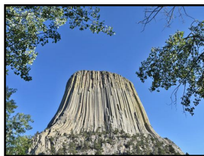
Devil's Tower, WY, scene of Close Encounters of the Third Kind.

Some US history is more poignant, such as the battle of Little Big Horn and the endless named soldier markers scattered across the rolling grassland hills of Montana. Little Big Horn was part of the group of historical sites we explored based around Custer, South Dakota. An unbelievable number of day trips are possible from this base including Mount Rushmore, Crazy Horse memorial,