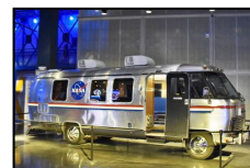
Kennedy Space Center and the Airstream crew transfer vehicle.