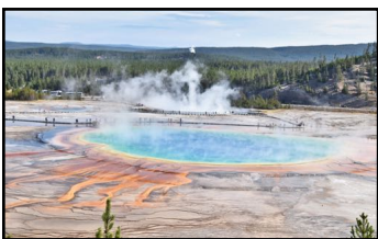
Colorful Yellowstone NP Prismatic Lake is over 200 degrees hot!

National Parks have been the backbone of our list of awesome destinations. Five in particular stand out: Yellowstone NP, Wyoming, Grand Canyon North Rim, Arizona, Death Valley, California, Bryce Canyon, Utah and Organ Pipe, Arizona. Apart from Bryce Canyon, we have been lucky to camp within the park confines largely due to advance planning. Each campground allows immediate hiking and wilderness access straight out of the door. It's places like these that remind you of the foresight of the NPS preservation over many decades if not a century to keep this heritage intact for future generations.