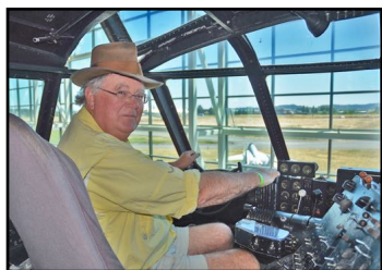
At the controls of the Spruce Goose and wearing Howard Hughes' hat!

Our travels have revived our interest in history, both ancient and modern, confirming that the United States has a wealth of moment in history destinations that help us learn and understand our heritage. We were particularly impressed with the Reagan Presidential Library in Simi Valley, California, and we have visited several other Presidential libraries but none come close to the splendor and depth of Simi Valley. The location and spaciousness, along with the excellent narrative make this a memorable visit. The beginning of the audio/visual technology era coincides with his presidency so access to high quality media makes this library a superb cutting edge experience. The illustrious list of corporate sponsors may also be a contributing factor to the success of this library.