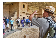
Mesa Verde NP Ranger leads our tour through the cliff dwellings.

Another Airstream destination with much more recent historic significance is Cape Canaveral, Florida, with history still being made today! Jetty Park is convenient for the Kennedy Space Center and frequent launches (thank you Elon Musk!) and has one of the best walking beaches along the coast. Further west, in Mesa Verde, Colorado, we immersed ourselves in an ancient civilization that flourished a thousand years ago (late 1100's) but mysteriously disappeared (by 1300's) as we scrambled through Long House, Balcony House, and Cliff Palace dwellings led by an NPS guide.