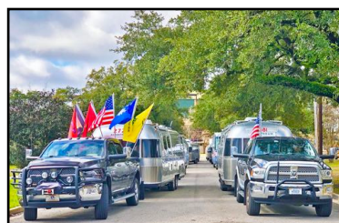
The third staging point after the town parade allows our rigs to be individually escorted by golf cart to their final pre-planned location in the Historic District.

Even though Henry had organized this event the previous year, I was still very impressed with the meticulous military style planning that goes into marshaling and staging 40 airstreams, starting with the Thursday night dry camping assembly at the marina. The following morning, fortunately bright and sunny, we inserted ourselves into a very specific pre-assigned