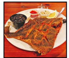
The signature dish of the Big Tuna restaurant - the deep fried entire flounder!

The SCCAC club members welcomed us in their midst and we shared meals and drinks with friends we had met on previous Alaska and Cajun caravans. New friends and acquaintances extended our greater Airstream family. We checked out as many restaurants as we could including River Room, Big Tuna and Graham's Landing. We stocked up on treats and gifts at the Indigo Bakery and chatted with the team who put together custom Airstream cookies that went into our official Georgetown welcome bag.