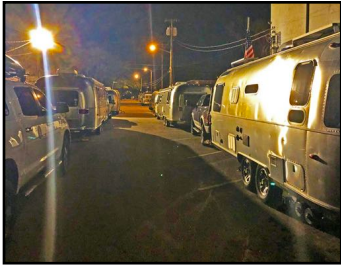
Night time in the Historic District on Orange Street. Temperatures dropped to the low 40's and a few generators were brought into action.

It goes without saying that the downtown rally takes a huge amount of organization, and my hat goes off