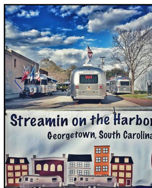
Safely parked on Orange Street, Georgetown SC, featuring the rally banner. This street was closed down which allowed for three parallel rows of Airstreams.

Airstream sequence (red numbers very important!) and were marshaled along the lengthy East Bay Park road where the convoy halted to install our flags before our 9:30 am ceremonial cruise down Highmarket Street with its canopy of live oaks into