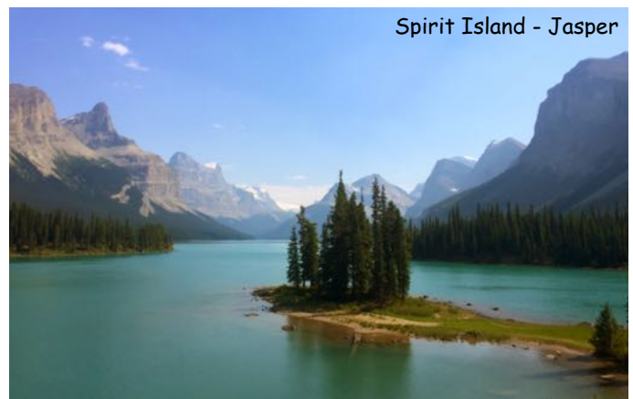
Spirit Island - Jasper